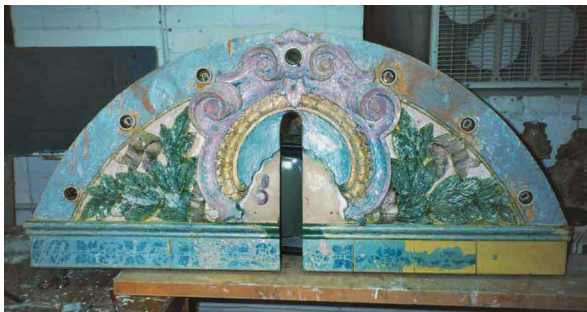
Most of this plaster round has been cleaned to the original paint.

Rosa softened several layers of unstable paint using a combination of heat and methylene chloride. She removed the loose paint with a blade.