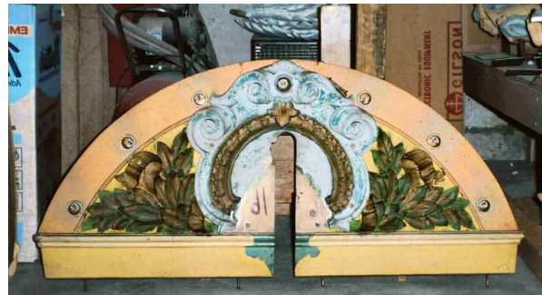
A plaster round before restoration.

For the last group of shell sections she restored, Rosa cleaned the pieces first with tri-sodium phosphate (TSP) and water. She removed any paint layers that looked unstable.